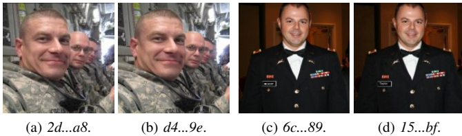
Fig. 2: Images reused by scammers in different profiles. Each sub-caption shows an excerpt of the hash of the image. Note that although certain images are perceptually equal, their hashes are different.