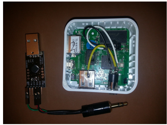
Fig. 2. Modified CPS devices for serial line recovery of uboot development

c) DNSSEC-based Secure Code Updates : An additional important problem in aviation (as in any CPS systems) is the software update and recovery. In older generations of CPS that rely on EEPROM firmware images, one needs physical access to the device to modify the code running on the CPS device, and this presents a challenge to both attackers and those managing the CPS system. On the other hand, newer generation CPS systems usually provide some LAN or serial-based update frameworks; for example some newer CPS hardware permit flexible management of IP parameters via BOOTP or DHCP, and image fetching via TFTP, serial and modem protocols. Such new