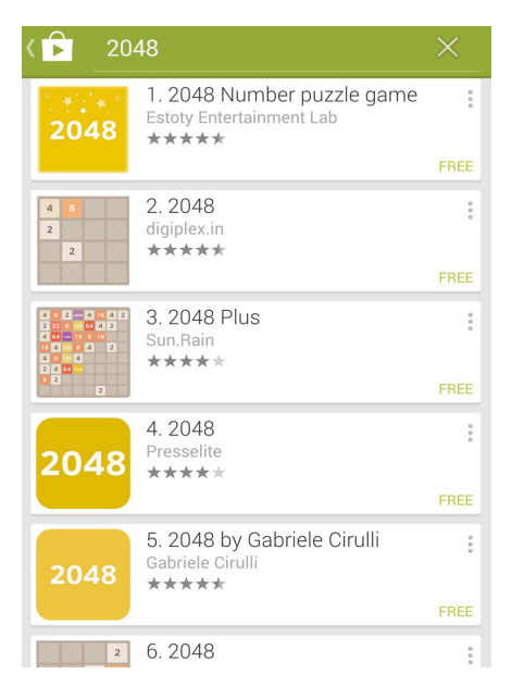
Fig. 4: A search for the popular "2048" game, returning several "clones." The app developed by the inventor of the game is listed in fifth position.

the app<sup>7</sup> is indeed associated with the organization that controls example.com. If desired, developers can also "pin" the site certificate in the app's manifest.