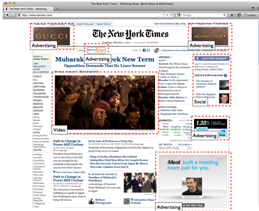
Figure 1. Third-party advertising, social, and video content on the New York Times website. Analytics content is not visible.

Web measurement provides objective, reliable evidence that both furthers public understanding and establishes a sound basis for policymaking.