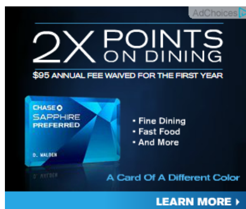
(b) Implemented icon and text [105] (actual size at 115 DPI).

icon’s] communication effectiveness over time”), and that the text “AdChoice” performed worse than alternatives.