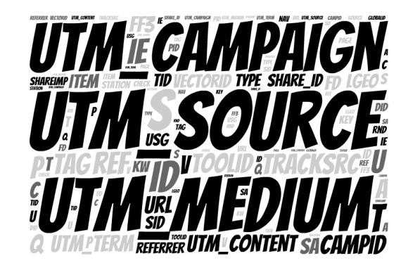
Fig. 2: Word cloud for common keys. Size indicates prevalence, with \log_2 applied to size weights for presentation

URLs for analysis were obtained from an industry partner which has access to a large quantity of URLs submitted